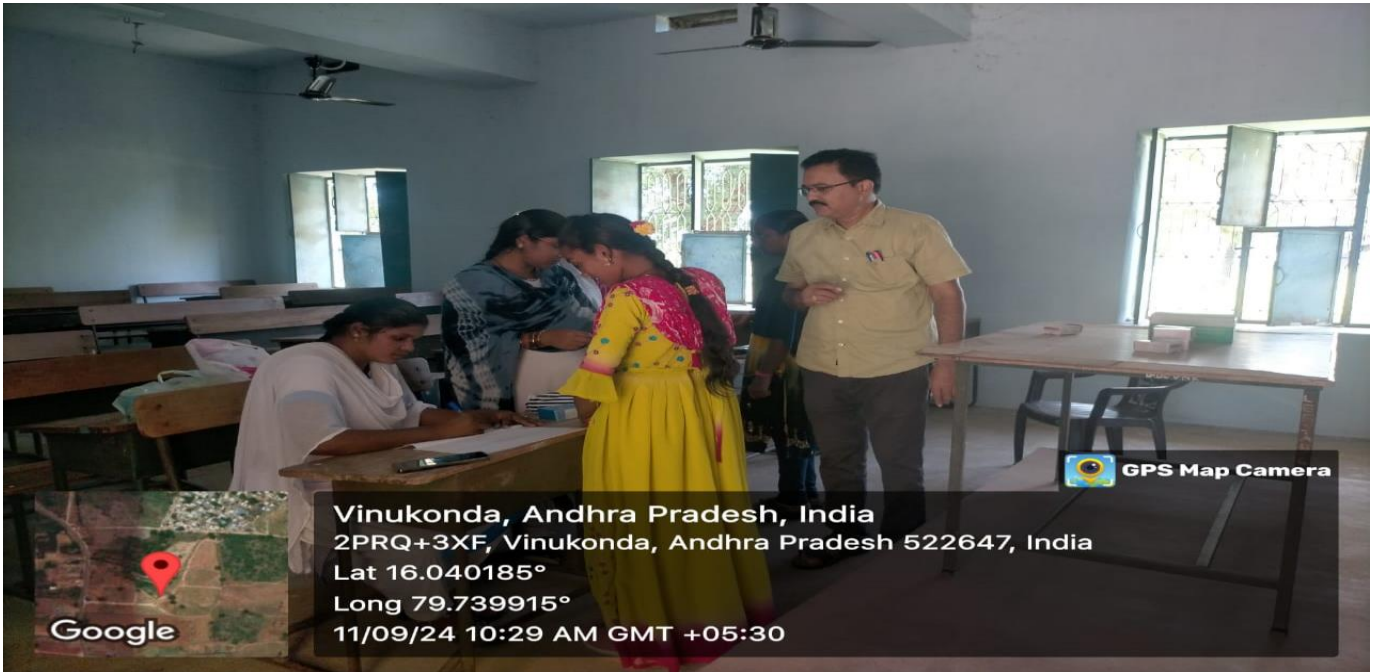
Hemoglobin testing camp Image 3