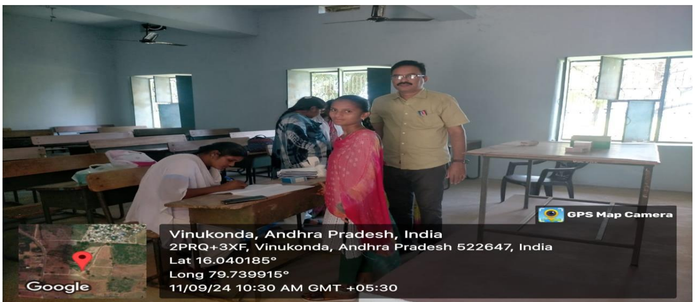
Hemoglobin Testing camp Image 2