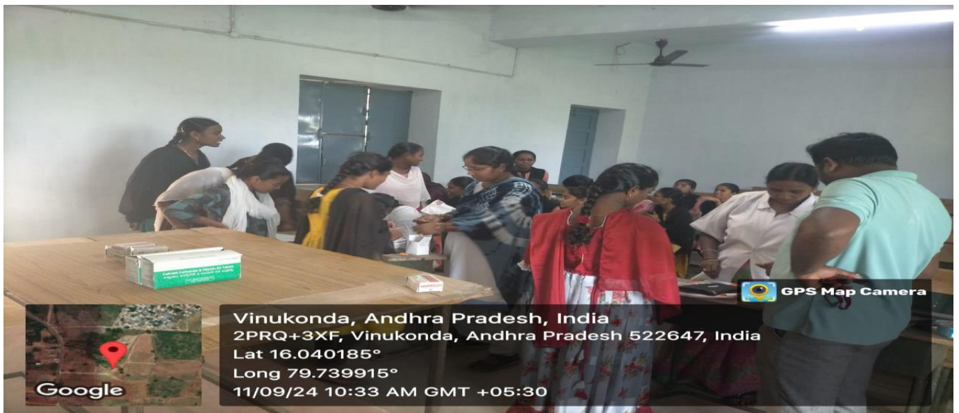
Hemoglobin tsting camp image 1

The hemoglobin testing camp was a valuable initiative that not only provided essential health services but also raised awareness about anemia and its prevention among students. SGK Govt Degree College, Vinukonda, plans to conduct follow-up programs and similar health camps in the future to ensure continuous monitoring and support for the well-being of its students