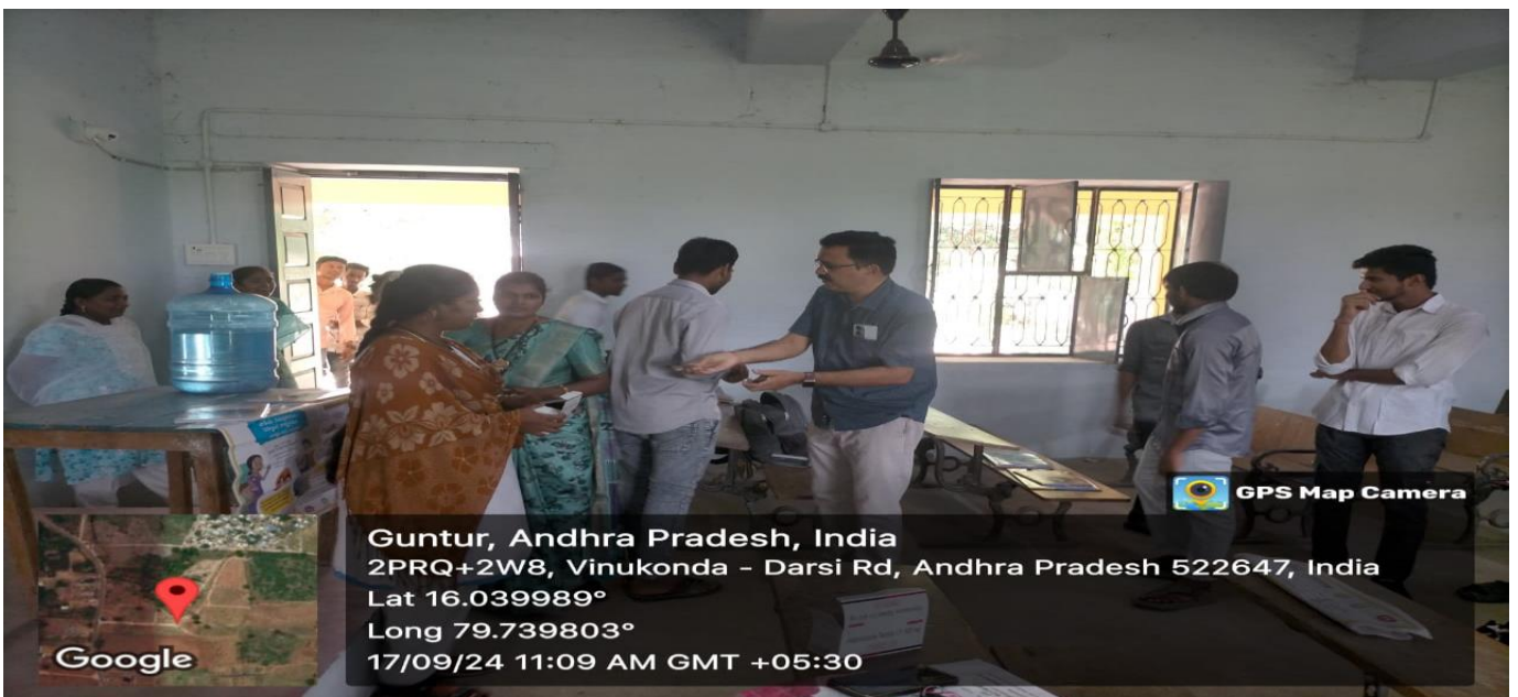
ALBENDAZOLE DISTRIBUTION IMAGE2