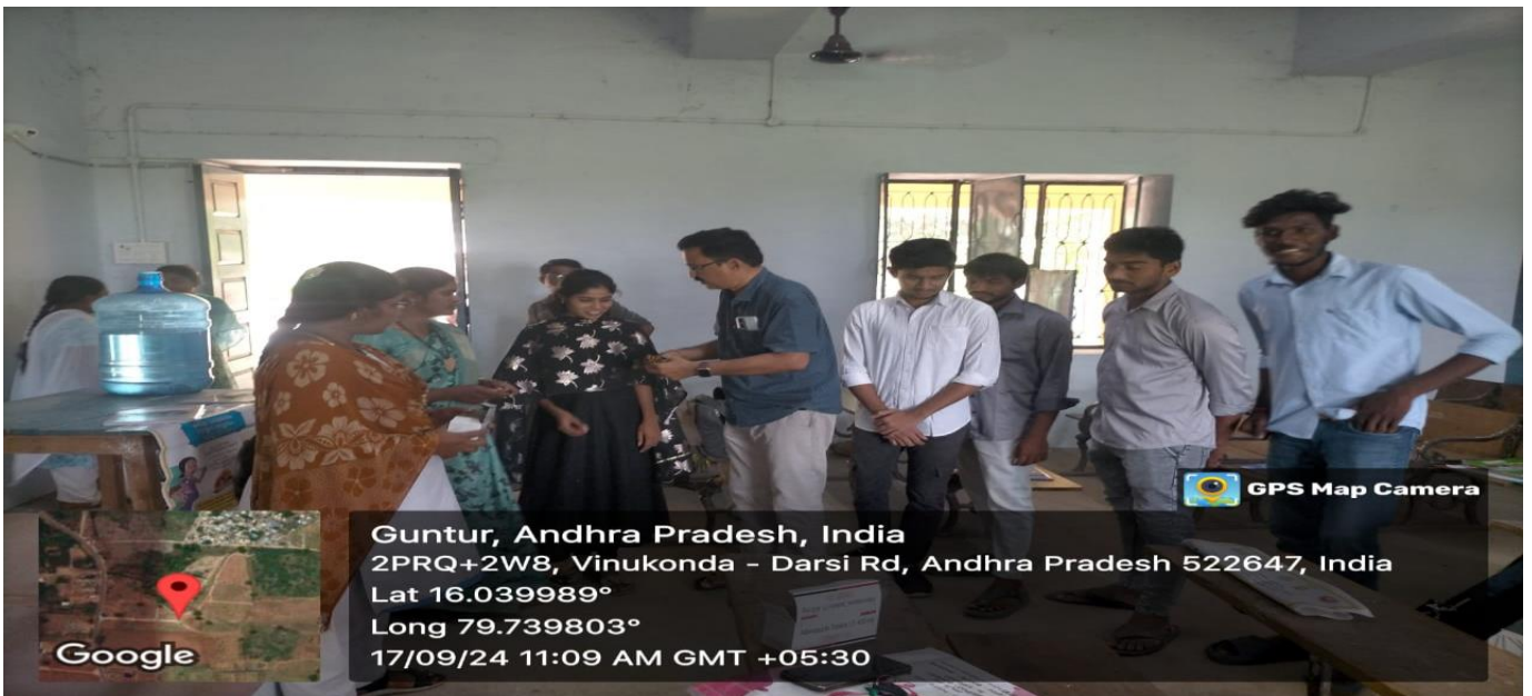
. ALBENDAZOLE DISTRIBUTION IMAGE1

The observation of National Deworming Day was a successful initiative that underscored the college's dedication to the health and wellness of its students. By partnering with the Community Health Centre and engaging faculty and students in this important health initiative, SGK Govt Degree College is making significant strides in promoting health education